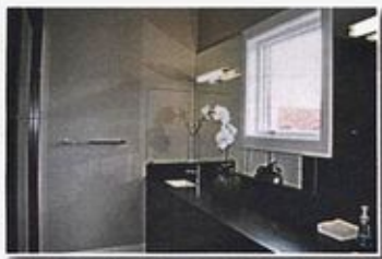
ABOVE: A large shower is tucked to one side of the master bath.