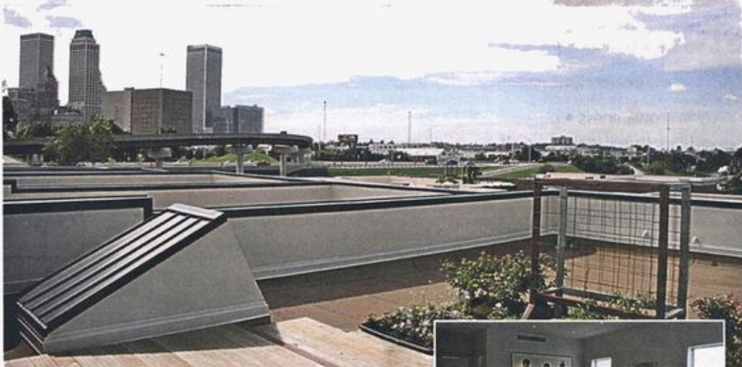
TOP: The expansive rooftop is plumbed for a hot tub and offers an incredible view.

The model townhome is listed for $895,000. For more information or to schedule an appointment to see the homes, contact Meltzer at 557-9118 or e-mail to smeltzer@cbtulsa.com.