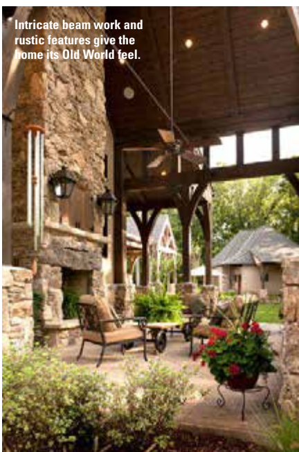
Intricate beam work and rustic features give the home its Old World feel.