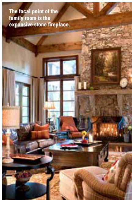
The focal point of the family room is the expansive stone fireplace.