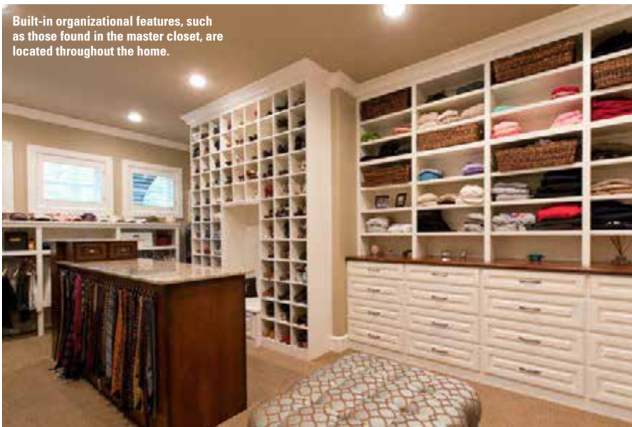
Built-in organizational features, such as those found in the master closet, are located throughout the home.