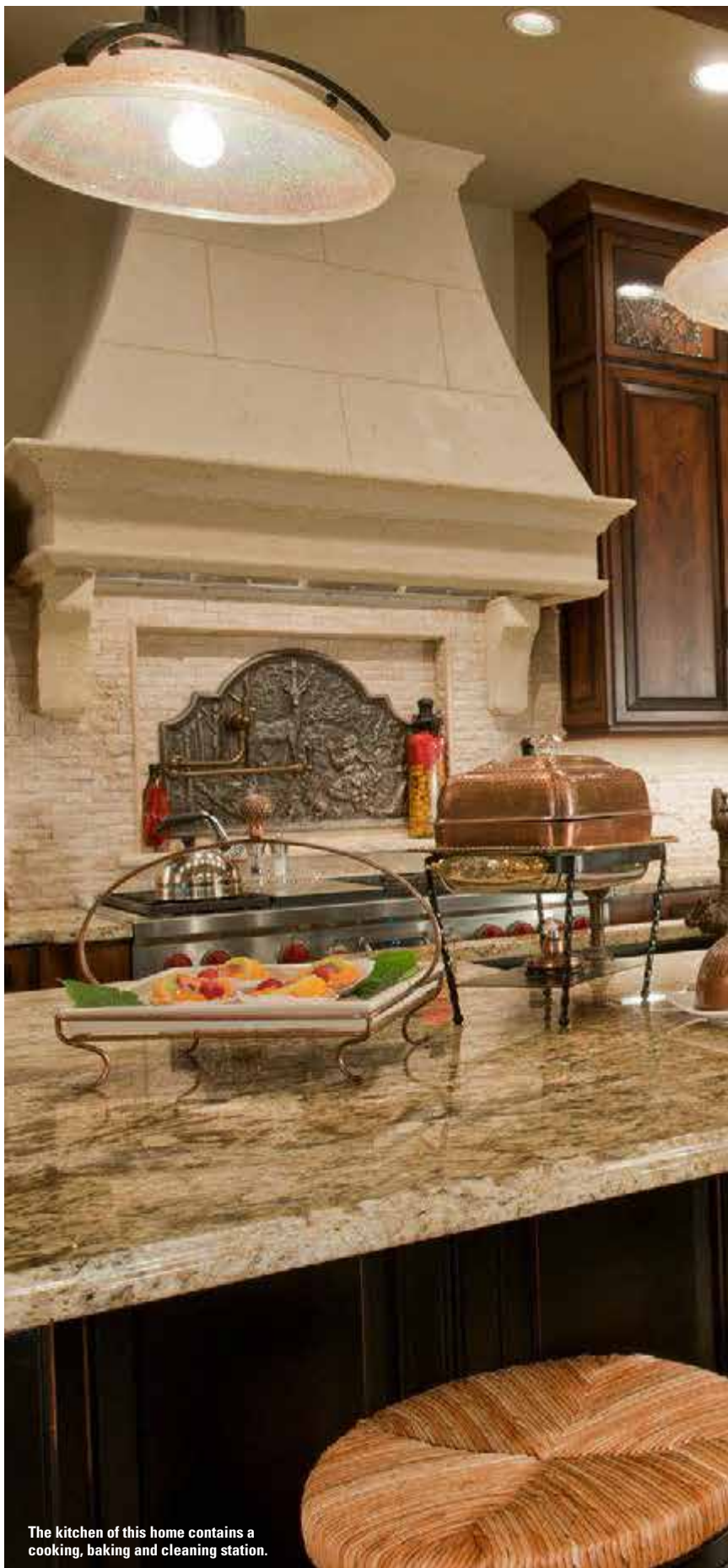
The kitchen of this home contains a cooking, baking and cleaning station.

In other areas of the house, there are meaningful numbers etched in stone or glass. For instance, the homeowners had the number “1676” carved into the glass on their pantry door be-